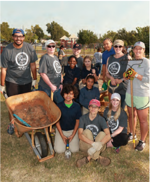
Matrix Service Company employees prepare to work in the garden at Eugene Field Elementary School.

The annual fall campaign will conclude at the “Unite!” celebration on Thursday, Nov. 9, at the newly renovated Tulsa City-County Library in downtown Tulsa. For more information, visit www.tauw.org .